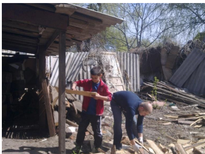
Drop-in centre repair

The Centre in Kharkiv was funded through project Bridging the Gaps: Health And Rights For Key Populations in 2015-2016. The movie about the Centre and some of its clients is available at https://youtu.be/oUvaRUCcePE