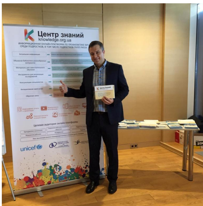
Commissioner on the Rights of Children at the office of the President of Ukraine Mykola Kuleba is our big supporter