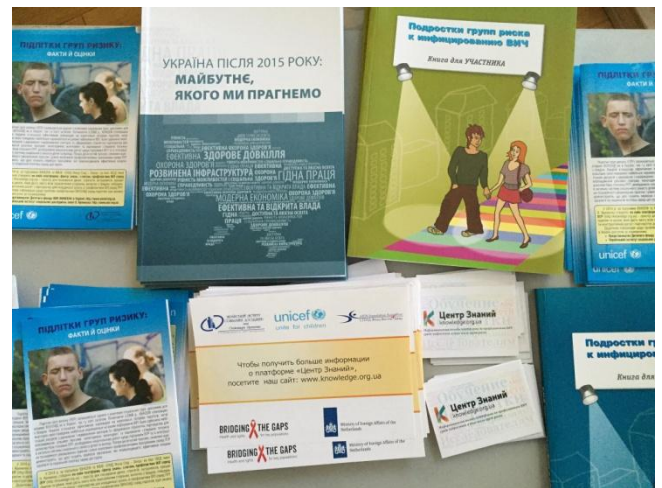
Information and educational materials for specialists working with MARA

Work with volunteers and peer leaders is still in plans. Given that the premises were purchased only in summer 2015, and the first half of 2016 was a transitional period for AFEW-Ukraine, waiting for the second phase of the project “Bridging the Gaps”, we will further develop activities with volunteers next year.