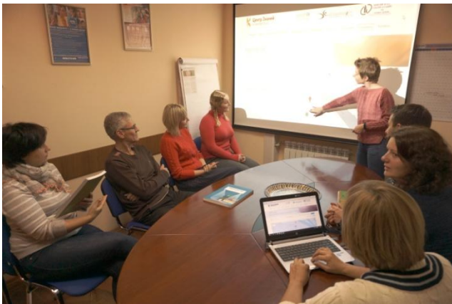
Strategic planning of the Resource Center development by AFEW-Ukraine staff

In summer 2015, using the contributions from several donors, including the contribution from AIDS Fondet, AFEW-Ukraine purchased the premises – 90 square meters that accommodates the office, and also has a room for organizing meetings, mini trainings, and a library of informational materials.