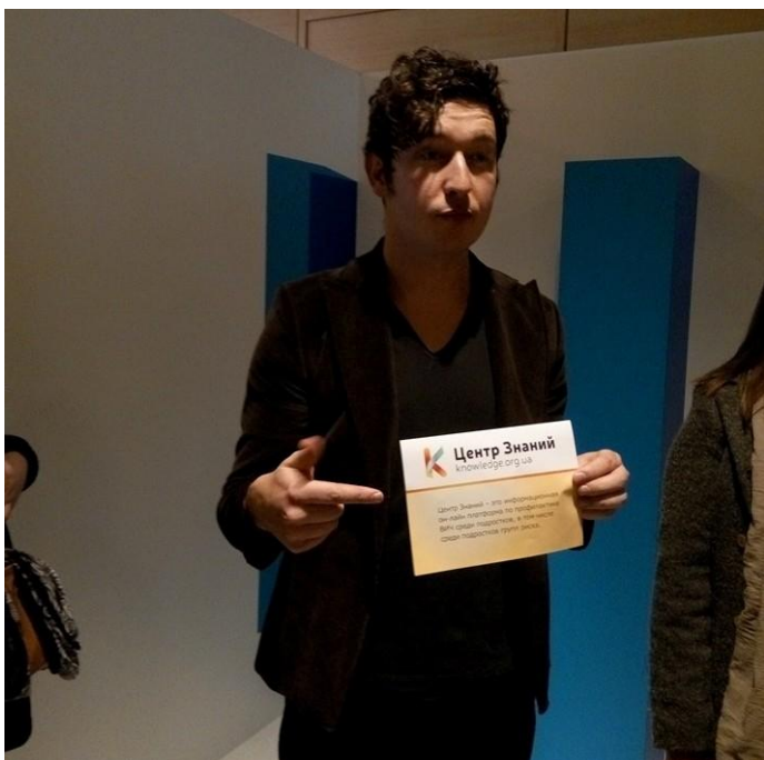
Very popular Ukrainian singer and musician Dmytro Shurov (Pianoboy)